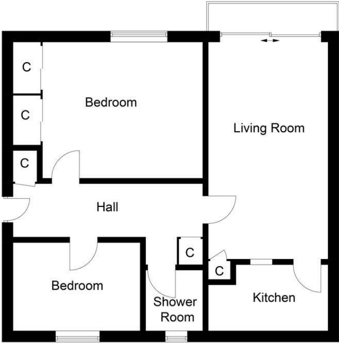
Illustration for identification purposes only, measurements are approximate, not to scale. Fourlabs.co © (ID1182093)